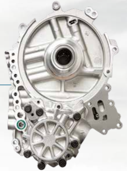
CVT Oil Pump