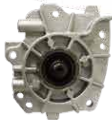
8 Speed ATM Oil Pump

SNT Motiv is carrying on its reputation of a global Tier-1 company with its auto parts technology that creates the best ride quality, safety, fuel efficiency and overall quality. We are trying our best to expand the production of eco-friendly, futuristic vehicles with the best technology. SNT Motiv's auto parts business is divided into powertrain, chassis, and airbag.