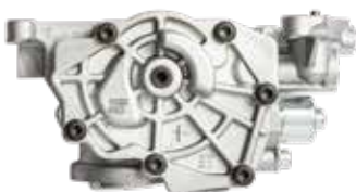
NGC Engine Oil Pump

The high efficiency, quiet and compact oil pump maximizes the drive motor system's fuel efficiency and durability. It supplies oil pressure for a granular control of the valve body, torque converter as well as the cooling and lubrication of the high-speed actuator.