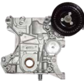
Gen3 Front Cover Module

Drive Unit is a key part of an electric vehicle ; the part is composed of a motor that creates drive torque and a reducer. The battery power supply generates torque and transports it via the reducer to fit the vehicle's driving needs.